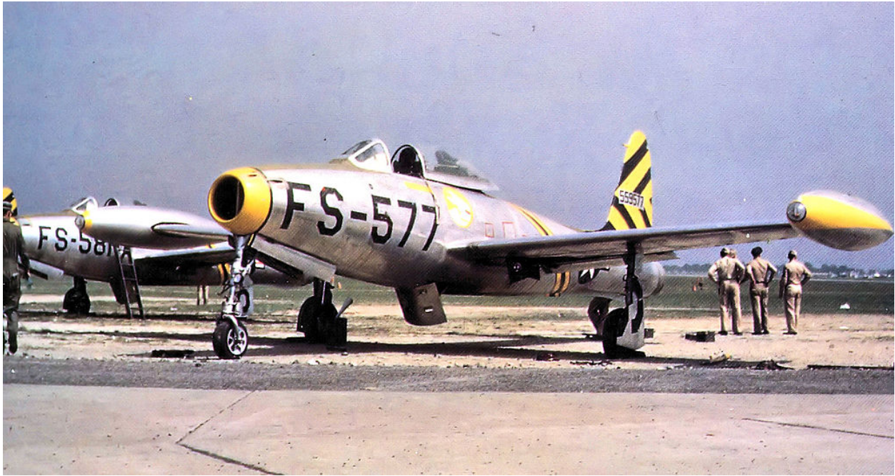
37 Fighter Squadron, Jet F-84