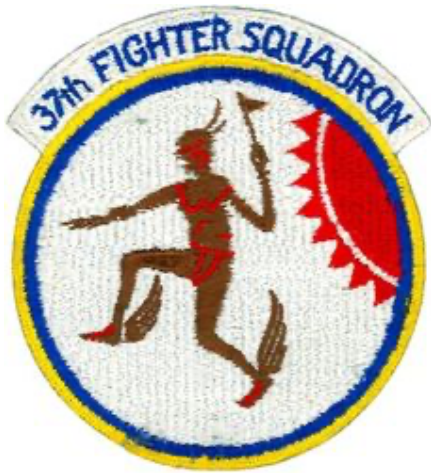
37 Fighter Interceptor Squadron emblem