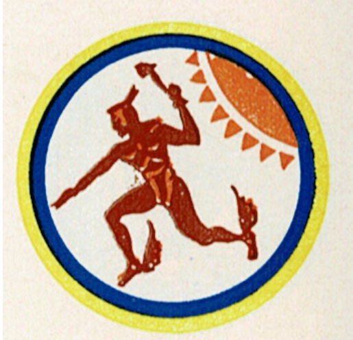
37 Pursuit Squadron