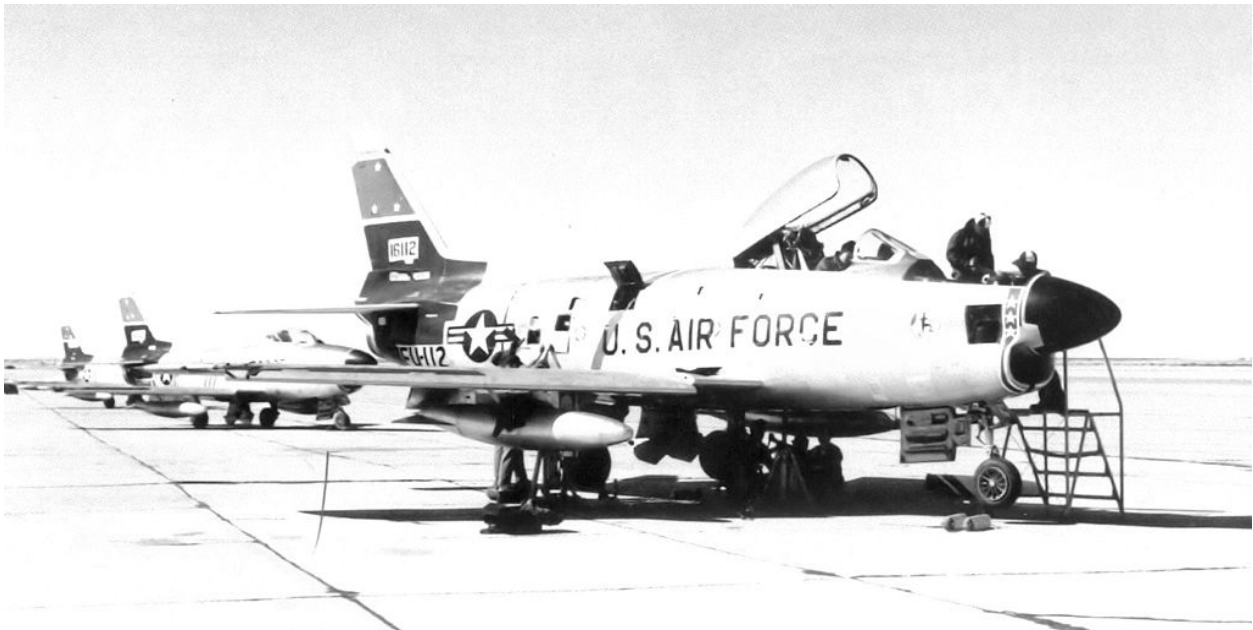
37 Fighter Interceptor Squadron F-86