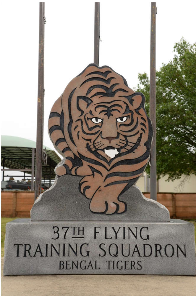
Squadron mascot outside of 37 Flying Training Squadron operations, Columbus AFB, Mississippi.